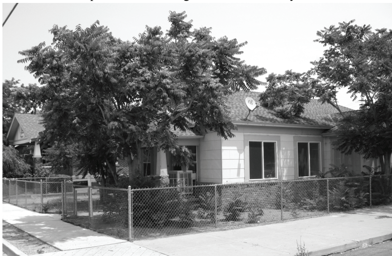
The new Family Promise Day Center location on 376 Wheeler St., Reno. The property includes other structures that allow future expansion to provide transitional housing for IHN guests.

The Family Promise Day Center is the hub of operations for the Interfaith Hospitality Network (IHN) shelter program and provides showers, washer and dryer, a computer for school work and job searches, an address for guests to put on important applications, a place from which children can enroll in school, and parents can receive case management services. It is a safe place for families to work toward permanent housing and self-sufficiency.